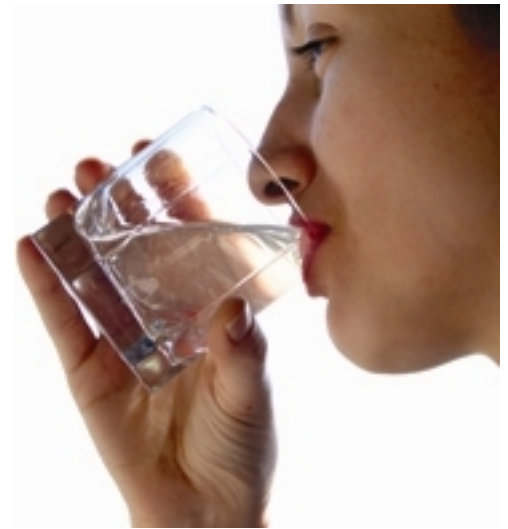
Water helps keep the body at optimum health.

Not only is water important for skin health, it can also play a key role in the prevention of disease. Drinking eight glasses of water a day can decrease the risk of colon cancer, bladder cancer, and potentially even breast cancer.